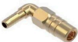
Fitting Male connector 90°