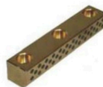
Self-Lubricating Guide Strip