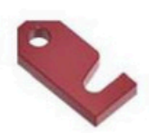
Tool Safety Device Lock