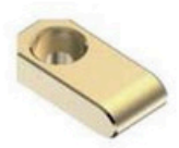
Lifter Guide Block