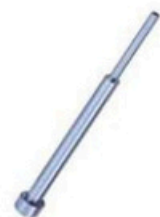
Stepped Ejector Pin Sleeve