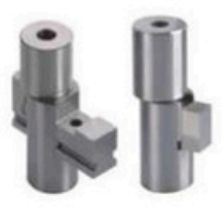
Slide Core Unit