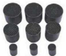
Sintered Gas Vent