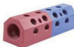
Mold Mounted Manifolds