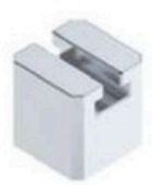
Slide Core Unit