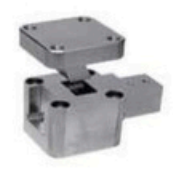
Slide Core Unit