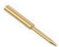
Pin-Point Gate Electrode