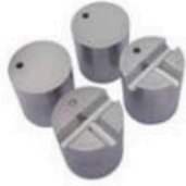
Runner Steering Control Valve