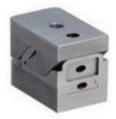
Slide Core Unit