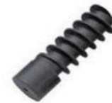
Spiral Water Conveying Rod