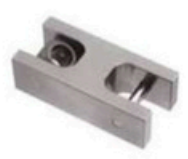
Jointed Slide Base