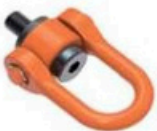
Hoist Swivel Eye Bolt