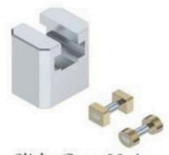
Slide Core Unit