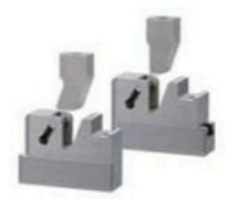
Slide Core Unit