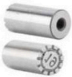
Die Casting Die Date Stamp