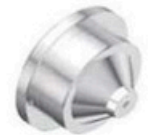
Large Gate Sprue Bushing