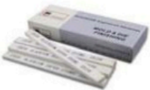
Oilstone Grinding Stone