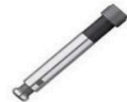
Liner Round Latch Lock