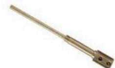
High-Flow Cascade Assembly