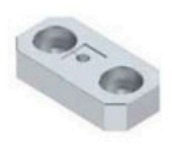
Lifter Guide Block