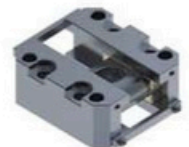
Slide Core Unit