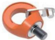
Hoist Swivel Eye Bolt