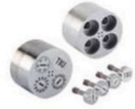
Date Stamp Combination