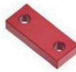
Hook Type Latch Lock