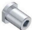
KO Connecting Pillar