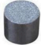
Steel (venting quality)