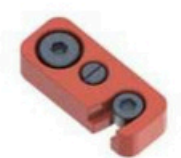
Tool Safety Device Lock