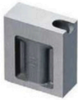
Cashew Gate Insert