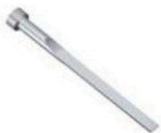
Flat Ejector Pin