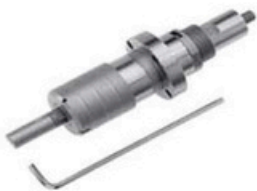
Two-Stage Single-Stroke Ejector