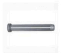
Shouldered Guide Pillar