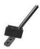
Slide Core Unit