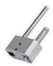
Slide Holding Device