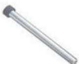
Puller Bolt (Type A)