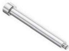
Runner Lock Pin