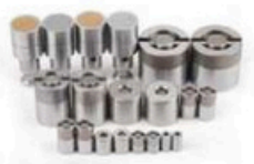
Air Valve(High Precision)