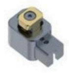
Slide Core Unit