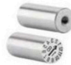
Replaceable Date Stamp with Screw End