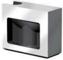
Cashew Gate Insert