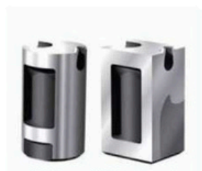
Cashew Gate Insert