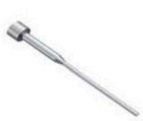
Shouldered Ejector Pin