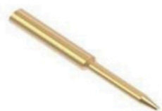
Submerged Burner Electrode