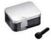
Replacable Date Stamp