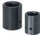
Liner Bushing for Parting Lock