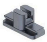
Slide Core Unit