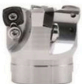
Indexable Face Milling Cutter