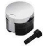
Replacable Date Stamp