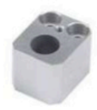
Inclined Pin Holder