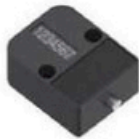
Square Mold Counter