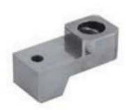
Cotter with Angle Relainer