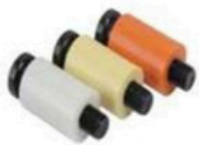
Nylon Parting Lock