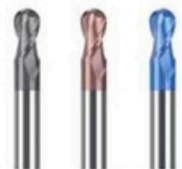
Ball Nose End Mill