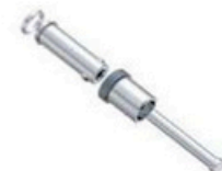
Reset Unit for Injector Pin Plate