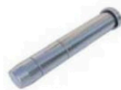
Shouldered Guide Pin