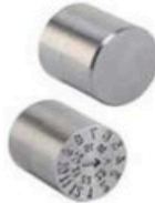
Three-layer Combined Date Stamp