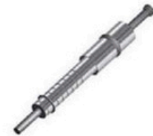
Early Ejector Return