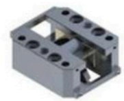
Slide Core Unit